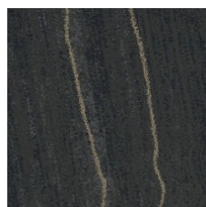
Colossal Bismuth 33496