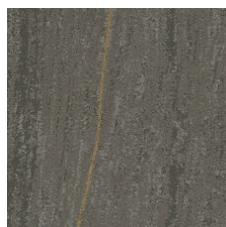
Cornerstone Copper 33555