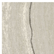
Carrara Silver 33100