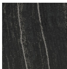
Onyx Silver 33505