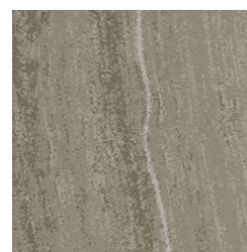
Element Platinum 33506