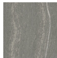
Forge Platinum 33518