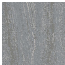
Talc Platinum 33535