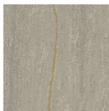
Alabaster Gold 33111